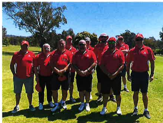
Mid-Murray (left) & YSM right) team photos

In the lead-up to Christmas, one of our more popular days was held, Christmas Cheer Day.